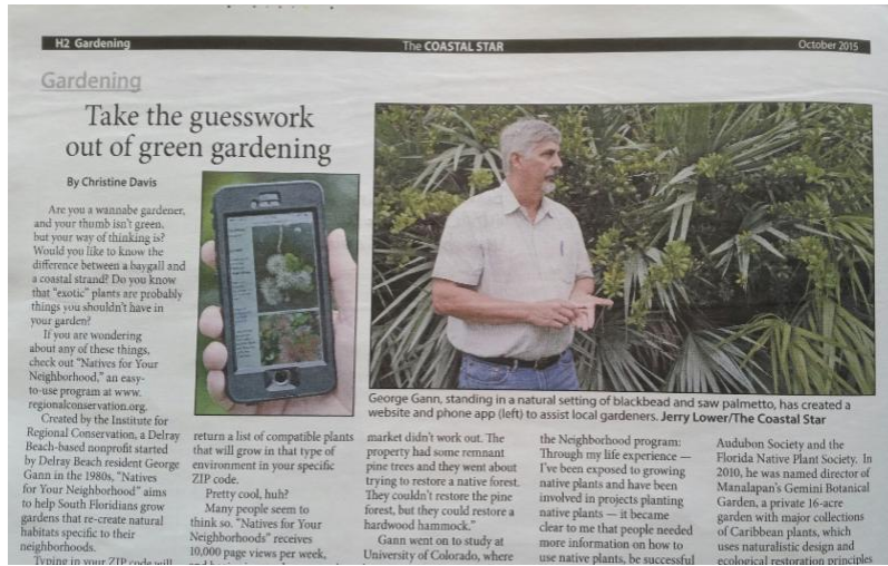
Above: A portion of the news article featuring Natives For Your Neighborhood in the Coastal Star.

IRC's Natives For Your Neighborhood Featured in Local Newspapers. In October alone, IRC's free online tool, Natives For Your Neighborhood, was featured as a story in the Delray Forum, Boynton Beach Forum, Community Forum, and Coastal Star. We are honored to have received this level of coverage and are hopeful that the articles inspired some of our South Florida natives to begin making native planting a priority.