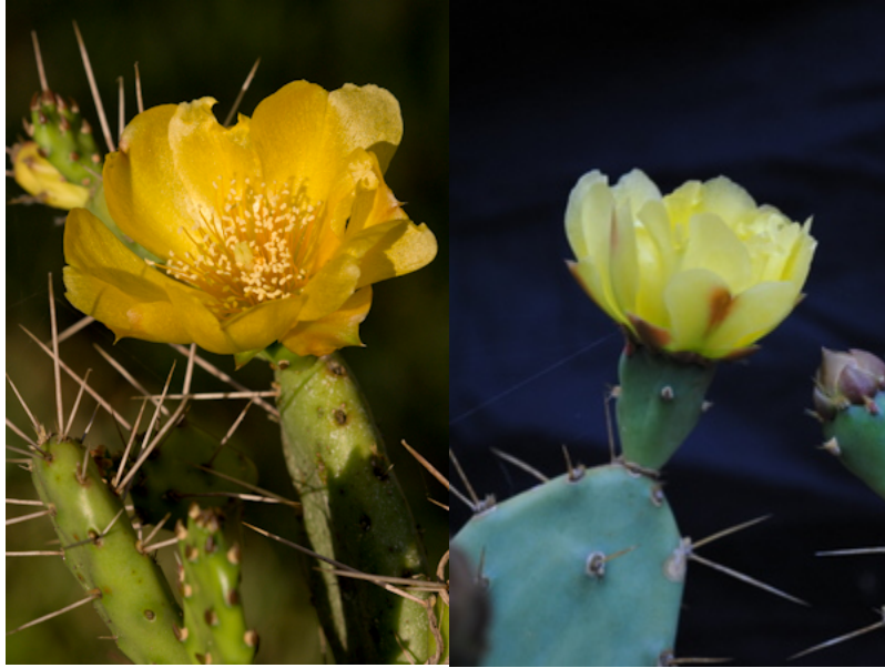
Left: Jumping cactus ( Opuntia abjecta )

IRC Participates in Global Study That Finds 1/3 of Cacti to be Threatened. George Gann was among the team of scientists that participated in an IUCN-led global Cactaceae assessment. The results of this assessment were published in the prestigious journal, Nature Plants , earlier this month. The study found that cacti are the 5th most threatened group of organisms assessed to date, following cycads, amphibians, conifers and warm-water reef building corals, with 31% of the Cactaceae threatened with global extinction. Threats include illegal collecting for the horticulture trade, land conversion for agriculture and residential development, and mining. In the Florida Keys, endemic cacti Opuntia abjecta and Opuntia ochrocentra are also threatened by rising sea levels.