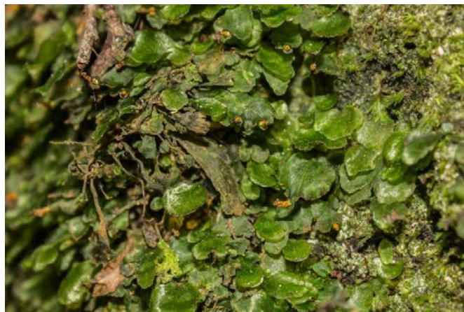
Above: Spores of the Florida bristle fern ( Trichomanes punctatum subsp. floridanum).

IRC Plays Key Role in "Endangered" Listing of the Florida bristle fern. The U.S. Fish and Wildlife Service is listing the Florida bristle fern ( Trichomanes punctatum subsp. floridanum ) as "endangered" under the Endangered Species Act. The fern has been a candidate for federal listing as endangered since November 2009. The official announcement was published in the Federal Register on October 6, 2015 and can be accessed on the species profile page here .