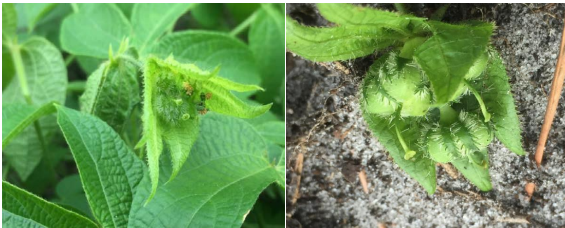
Above: Photos of Dalechampia scandens on site.

At Hobe Sound Natural Wildlife Refuge, IRC has started on another invasive species management project that involves targeting over twenty invasive species found within 103 acres of the property. In Broward, IRC staff began invasive plant management targeting the vine commonly known as spurgecreeper ( Dalechampia scandens ). This invasive is unique because it has only recently become naturalized and was first observed in Broward County in 2005.