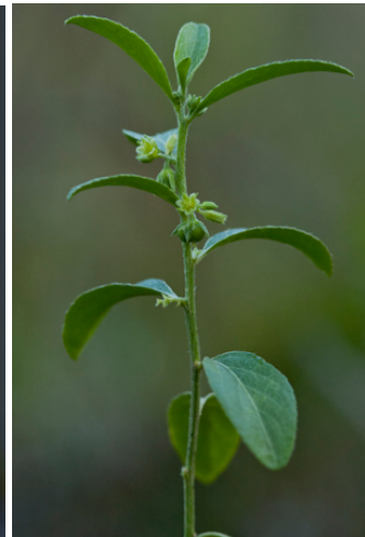
Top Left: Big Pine partridge pea ( Chamaecrista lineata keyensis ). Top Right: Wedge spurge ( Chamaesyce deltoidea serpyllum ) Bottom Left: Sand flax ( Linum arenicola ) Bottom Right: Blodgett's silverbush ( Argythamnia blodgettii )