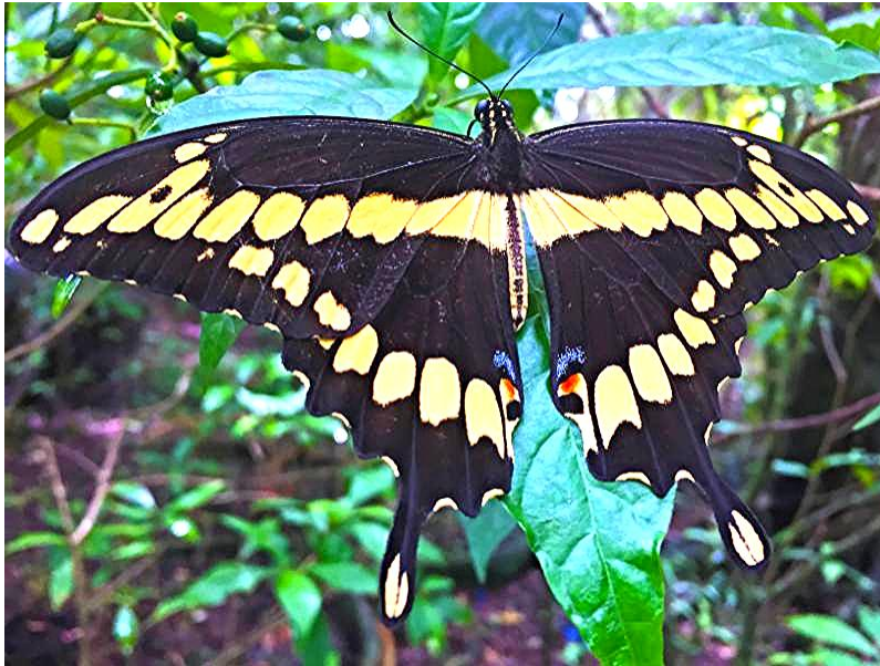
Above: A Giant Swallowtail found during a survey at Homestead Air Reserve Base.